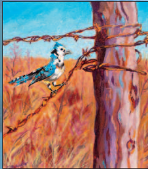
From the Prairies...